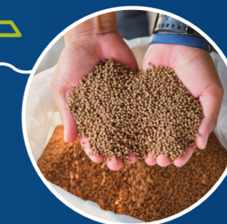
Aquaculture Feed Scientist