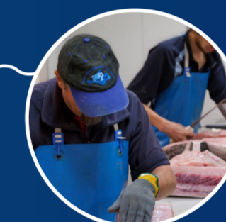
Processing Attendant/ Processing Hand