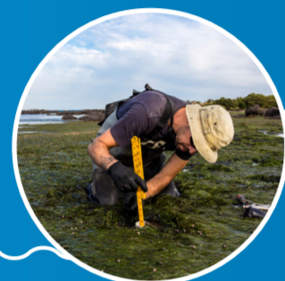
Conservation Officer (Fish & Wildlife)