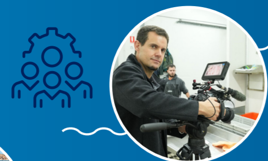
Communications and Engagement Manager