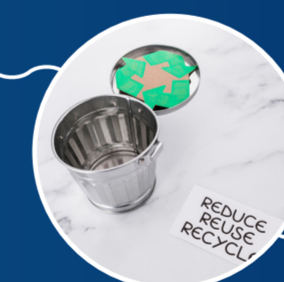
Sustainability (Circularity) Program Manager