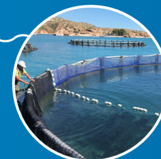
Aquaculture Farmhand/Farm Attendant