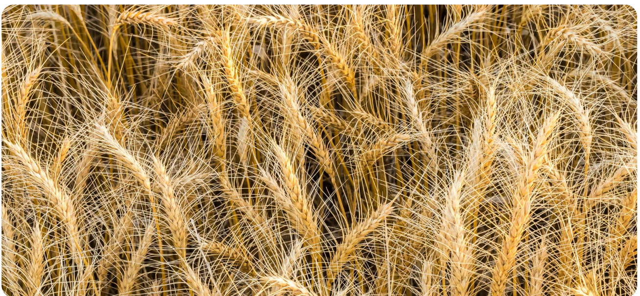
Flanker wheat heads just before harvest in December 2018, which was a very dry season.